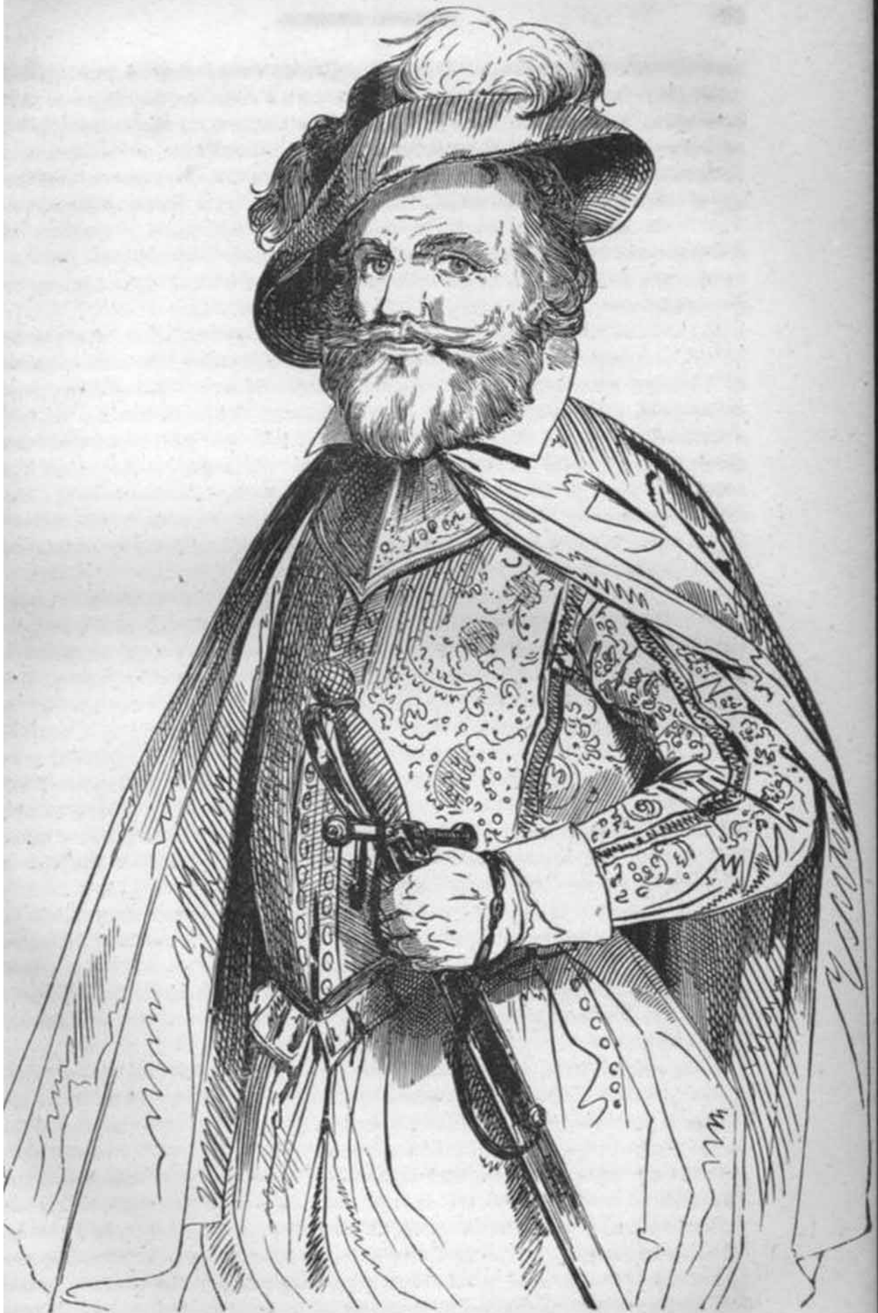
CAPTAIN JOHN SMITH.

From a portrait showing him in the fashionable dress of the period in which he lived.